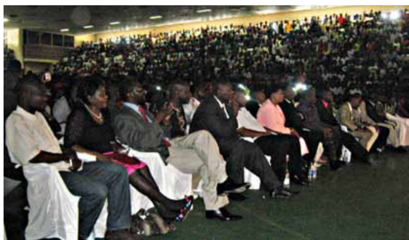
Part of the people at the peace prayer in Chitungwiza

The MDC is committed to sustainable peace, President Tsvangirai and Zimbabwe's Prime Minister has said.