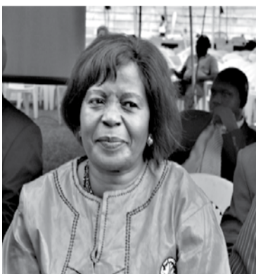
Hon Theresa Makone

Hon Theresa Makone, the MP for Harare North and Minister of Home Affairs said her constituency is her priority when she speaks of developmental projects. She says, it will be her fulfilment if she is able to capacitate children to become the best they could be.