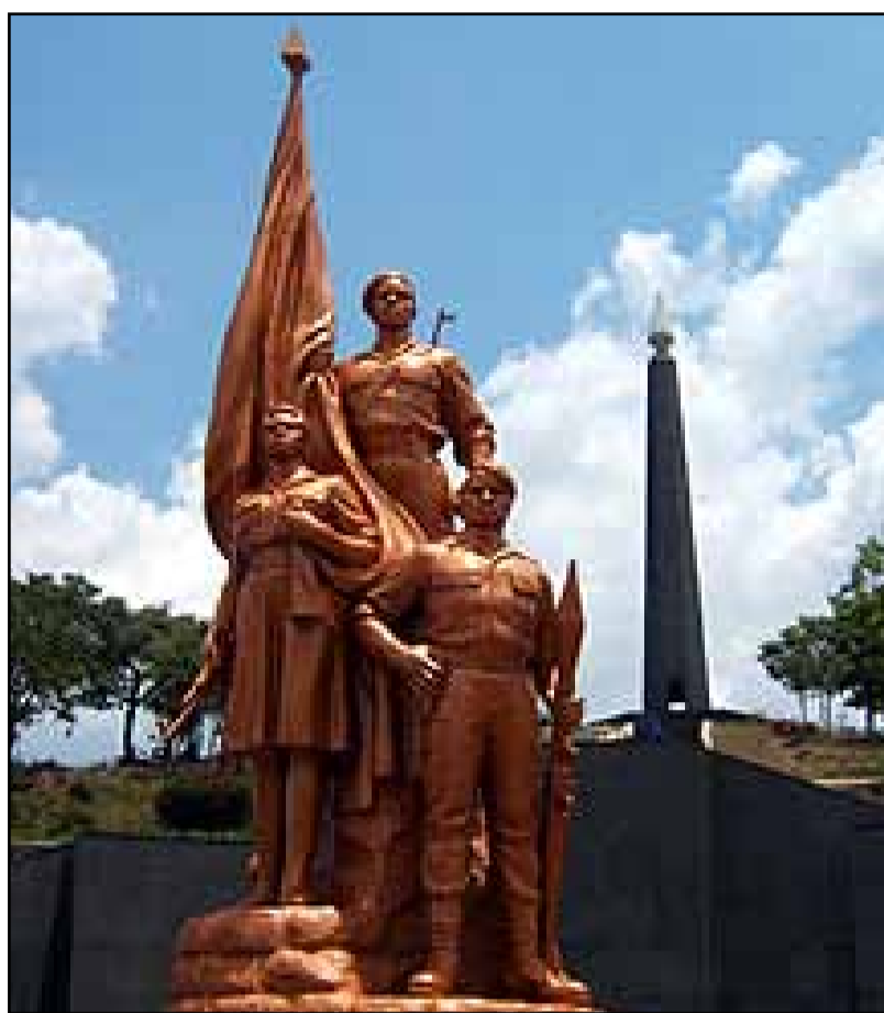
The Heroes' Acre in Harare

The partisan decision making process used by Zanu PF is based on the