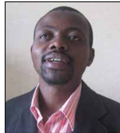
ZINASU president Obert Masaraure

Also of concern is the continued harassment of female students where they have fallen prey to the male lecturers who are demanding sexual